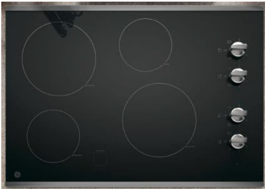
Recalled GE electric radiant cooktop, model no. JP3030SJ4SS