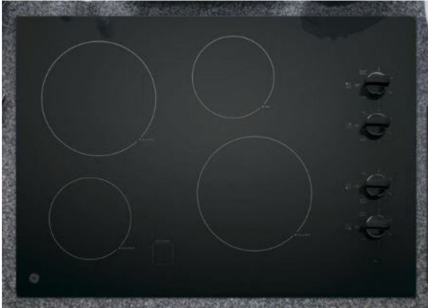
Recalled GE electric radiant cooktop, model no. JP3030DJ4BB